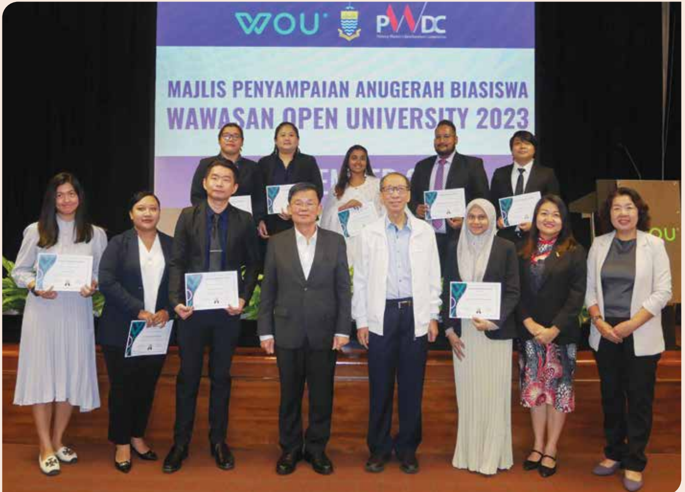
▲ Tan Sri Koh Tsu Koon and Penang Chief Minister, YB Chow Kon Yeow with the WOU Scholarship recipients.

Ten students from Penang received full scholarships for their studies at WOU, pursuant to the University's collaboration with the state government and Penang Women's Development Corporation (PWDC).