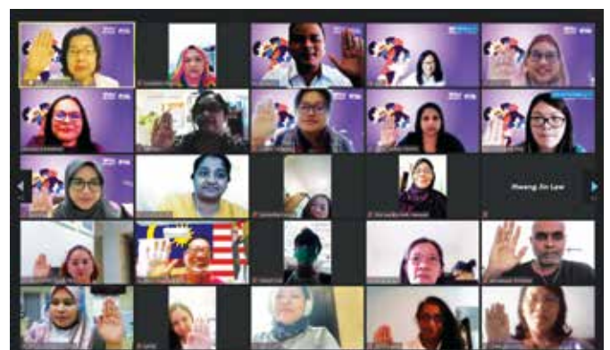
▲ United against gender stereotyping.

She called for women's equal access to resources and opportunities, and for collective action to create a gender-inclusive environment.