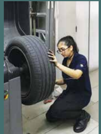
▲ Hard at work at the auto shop.