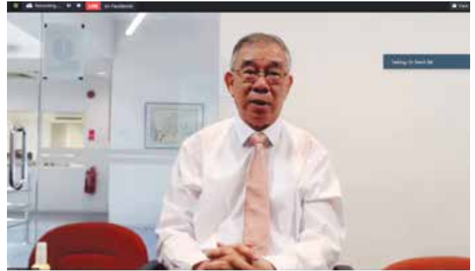
▲ Sharing his knowledge during the webinar.

He also spoke about the various types of Covid-19 tests, namely RT-PCR, RTK-Antigen Test and the Antibody Test. "RTK-Antigen testing is useful if you detect a staff with symptoms as then you can quickly isolate all the close contacts in category 2. However, you need to reconfirm with a RT-PCR test."