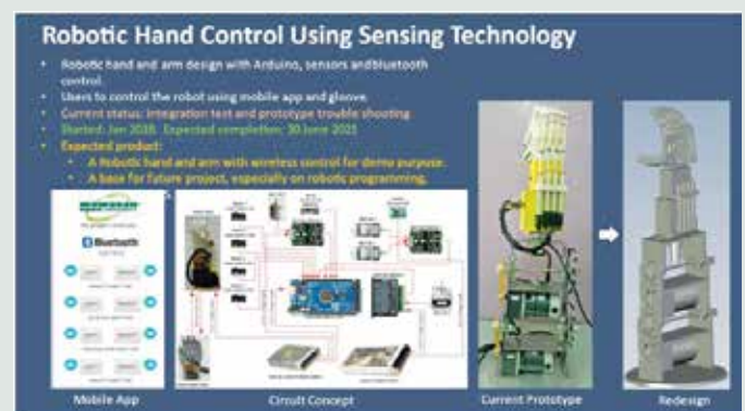
▲ Illustration of the project.

Currently, the robot can only be used in short-distance wireless control and performs very simple movements.