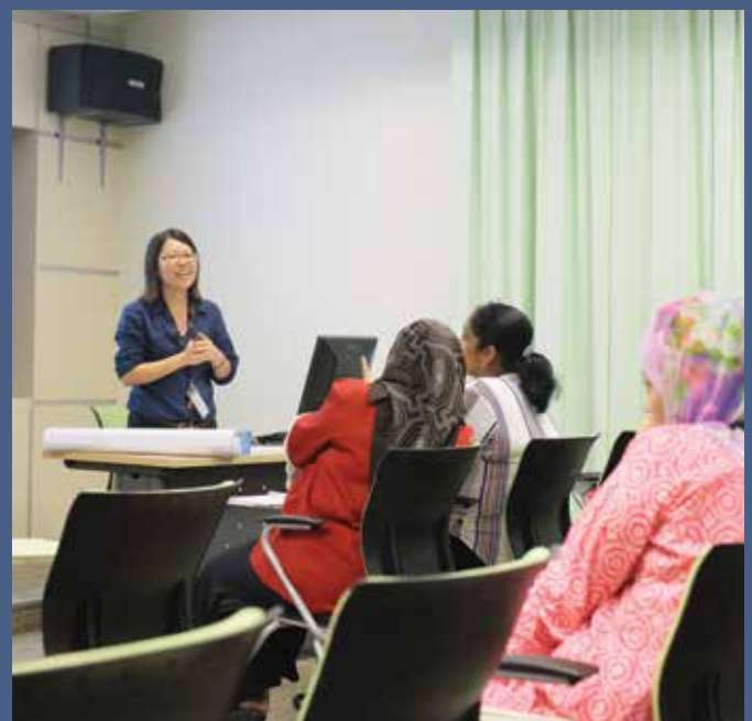
▲ Dr Por conducting a workshop (filepic - before the pandemic).

She encouraged educators to upskill, re-skill and cross-skill themselves, especially in times of uncertainty so that they are versatile and ready to learn new skills beyond their job scope to be multifunctional.