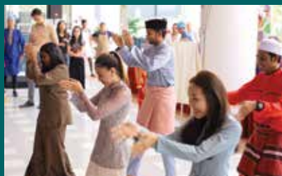
◀ Entertaining Malay dance thrills the crowd.