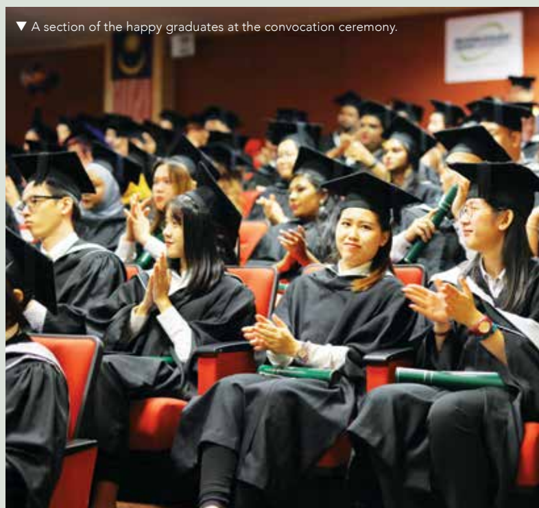
▼ A section of the happy graduates at the convocation ceremony.

Technological advancements and digital disruptions are changing the nature of work, and the types of skills and jobs that are now in demand. Employers want graduates with a breadth of knowledge across disciplines, with critical thinking skills and the ability to understand changing outlooks.