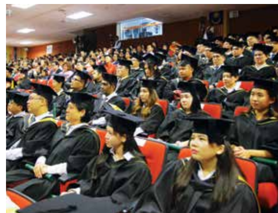
▲ Vice Chancellor Prof Lily Chan presided over 4 of the 7 sessions of the convocation to present scrolls to the graduating students.

WOU's latest tagline 'Think Tomorrow' is a reflection of its foresight in equipping students to meet the imminent new demands of the world in the near future.