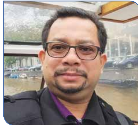
◀ Dr Khairur wants SMEs to take concrete steps towards IR 4.0.

Industry4WRD policy is a national policy to transform the manufacturing sector and related services within the period from 2018 to 2025. Under Industry4WRD, the government