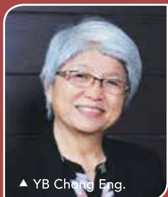
▲ YB Chong Eng.

There is a serious need to strengthen access to psychological first aid (PFA) for survivors of domestic violence to make them feel safe, calm and hopeful, and also connect them to helpful information and services.