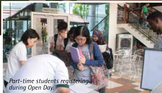
Part-time students registering during Open Day.