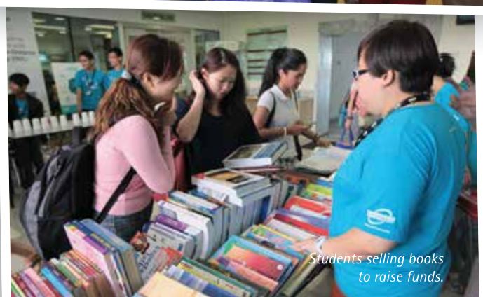
Students selling books to raise funds.