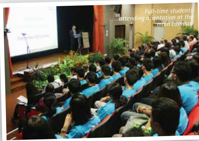
Full-time students attending orientation at the main campus.

The University prides itself in delivering quality industry-driven programmes, which are recognised and approved by the Malaysian Qualifications Agency and the Ministry of Education.