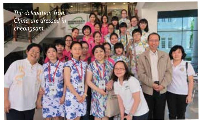
The delegation from China are dressed in cheongsam.