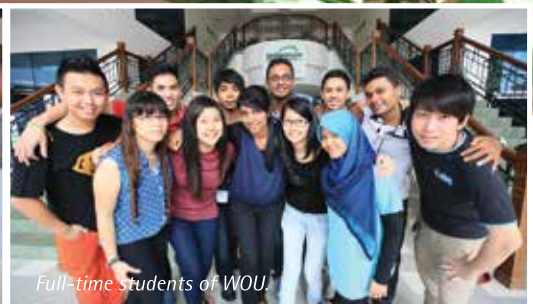
Full-time students of WOU.

The grand vision of world-class education standards, as envisaged in Malaysia's national ideal of Wawasan 2020, includes the development of higher education that is accessible and affordable, even as it is ever-enhancing and evolving in quality.