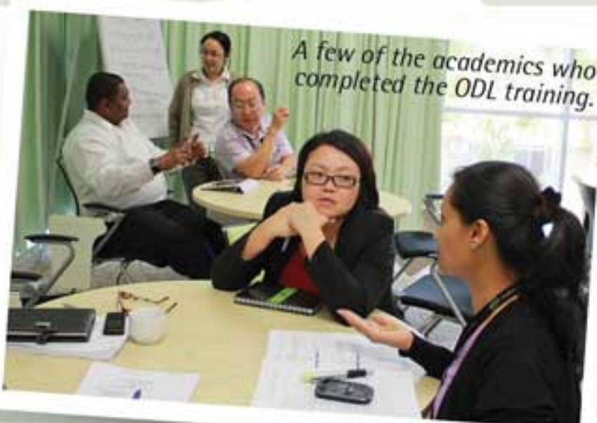
A few of the academics who completed the ODL training.

He explained that WOU is currently repackaging the whole training programme to integrate new developments, especially the Open Educational Resources (OER) that the University plans to adopt. "We are at the moment finalising the curriculum framework to five modules and a project."