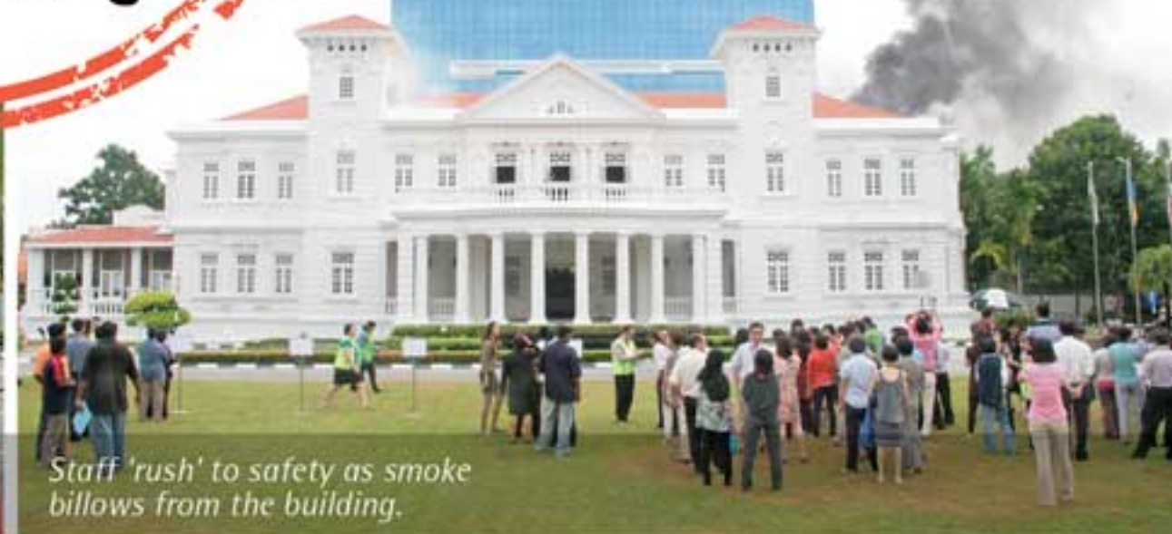
Staff 'rush' to safety as smoke billows from the building.