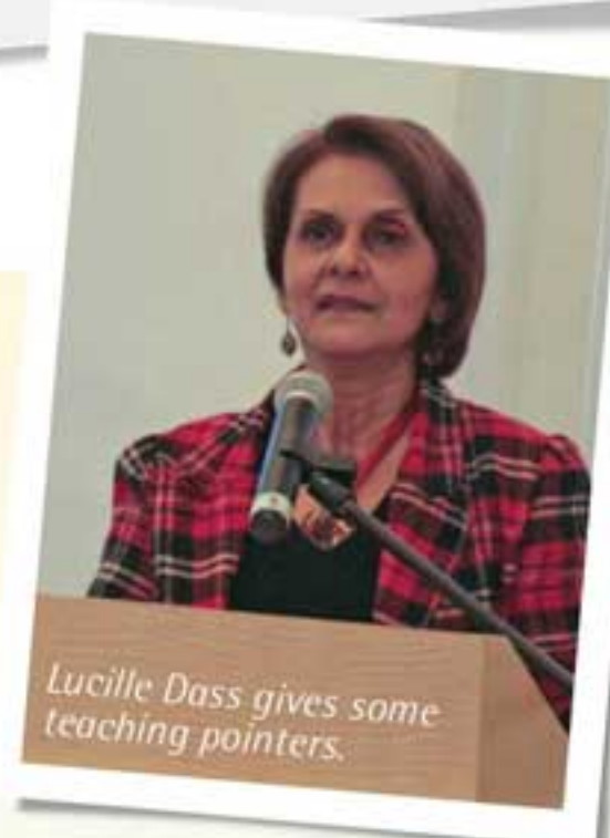
Celebrating Teacher's Day at the main campus.

Her advice to all teachers was simple, "The only way to improve is by being sensitive to the students' responses when teaching and to place students at the heart of teaching." She continued, "Teachers are not knowledge givers because knowledge is everywhere, but what they need to do is to help learners to access and retain knowledge that is relevant to them."