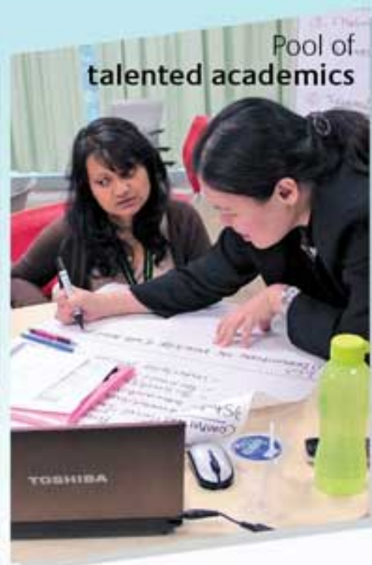
Pool of talented academics