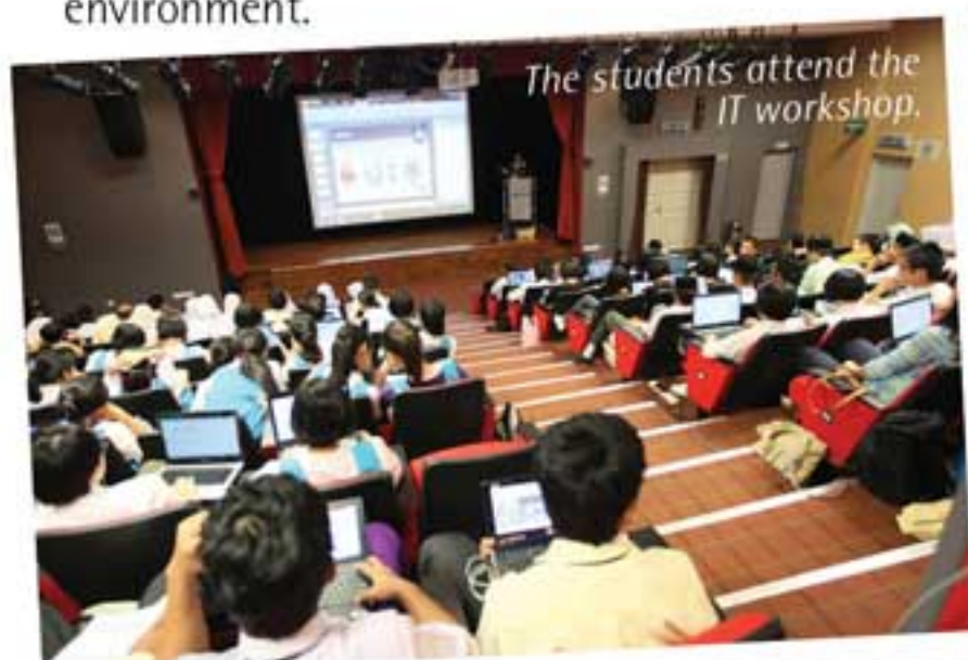
The students attend the IT workshop.

Wawasan Open University (WOU) together with First Solar Malaysia and STEC Technology held an IT Workshop at the main campus as part of the Young Enterprise (YE) Programme's initiative to expose student achievers to the basic technology available to them in today's business environment.