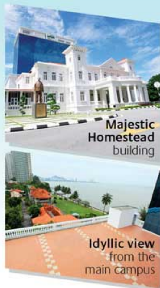
Majestic Homestead building