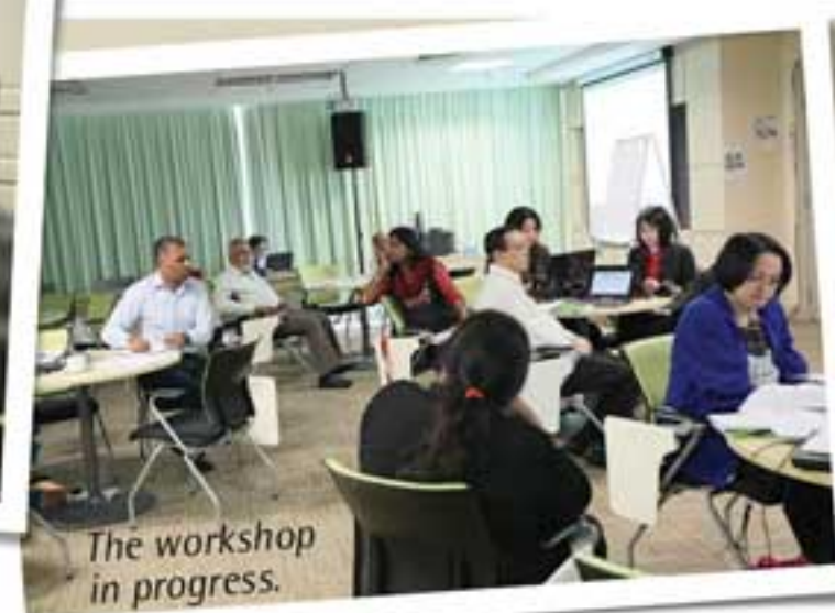
The workshop in progress.

edit the course – the final outcome will be an OER-based course that can be used for training purposes by any institution. The course package will also include four case studies capturing experiences of institutions in the creation and integration of OER. This includes the experience of WOU in the use of available OER for developing a course on 'ICT in Education' for its Master of Education programme.