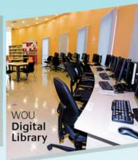
WOU Digital Library