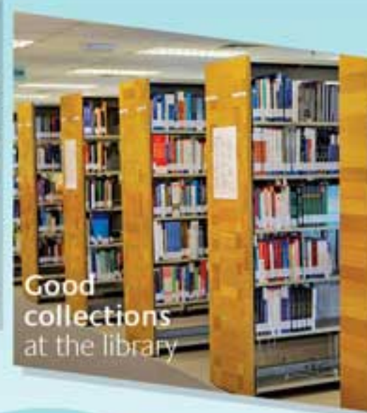
Good collections at the library