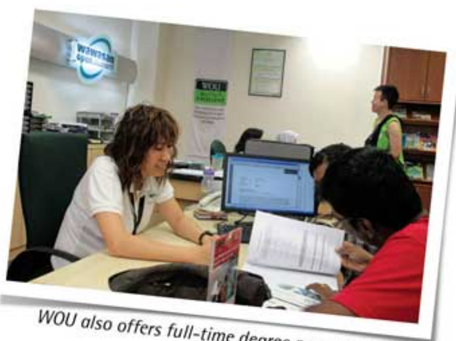
WOU also offers full-time degree programmes.