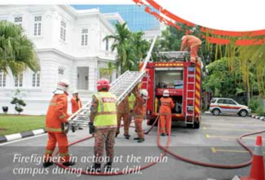
Firefighters in action at the main campus during the fire drill.