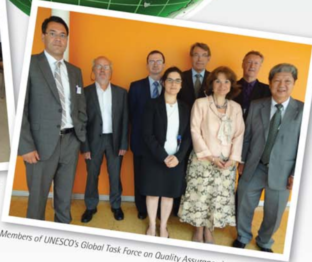
Members of UNESCO's Global Task Force on Quality Assurance in e-Learning