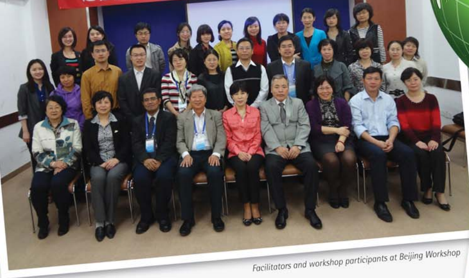
Facilitators and workshop participants at Beijing Workshop