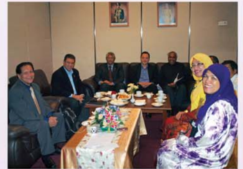
Deputy Higher Education Minister Dato Saifuddin Abdullah (seated, 2nd from left) with the panel

since education is one of the 12 National Key Economic Areas (NKEAs) of the Economic Transformation Programme.