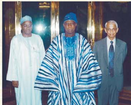
With African VCs.