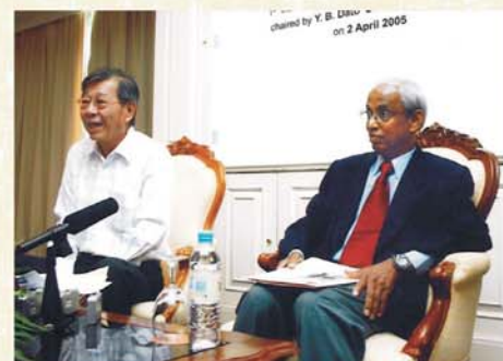
Tan Sri with WOU's Chairman of Council at WOU's first Council meeting in 2005.

He retired as President of COL in 1995 and played a key role in establishing Wawasan Open University, becoming WOU's first Vice Chancellor in 2005.