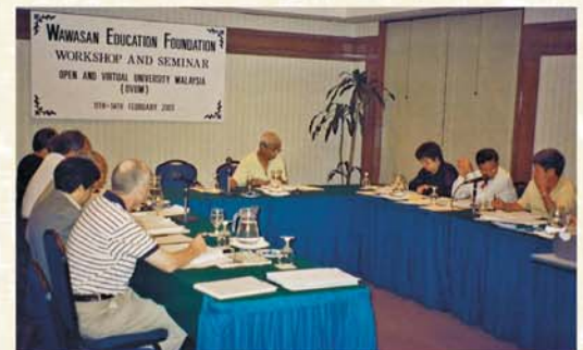
An initial meeting of the WEF to establish what would become WOU.