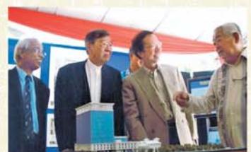
At the groundbreaking ceremony at WOU's main campus with Tun Dr Lim Keng Yaik, Tan Sri Dr Koh Tsu Koon and Tun Dr Lim Chong Eu.