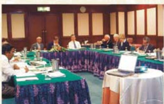
An early Council meeting before the establishment of WOU.