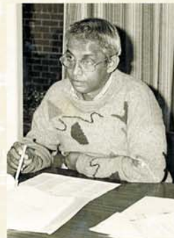
Deep in concentration.