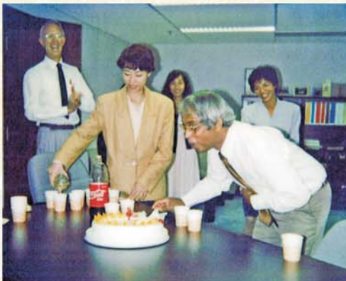
Birthday celebrations with OUHK colleagues.