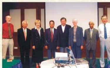
Members of the International Advisory Board (IAB) with Tan Sri and WOU Chairman of Council, Tun Dr Lim Keng Yaik.