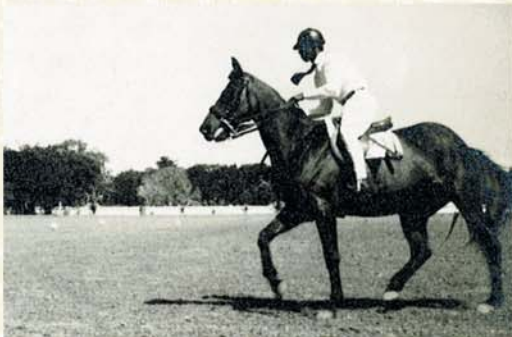
In action on the polo grounds!