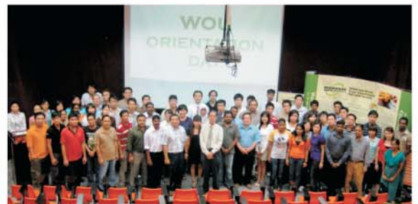
Johor Bahru – The Orientation Day organised by the Johor Bahru regional office at Southern College was attended by 102 new students as well as JBRO Student Club members and staff.

He spoke on the ODL model and later conducted a briefing for the Commonwealth Executive Master of Business Administration and Master of Public Administration (CeMBA and CeMPA) students.